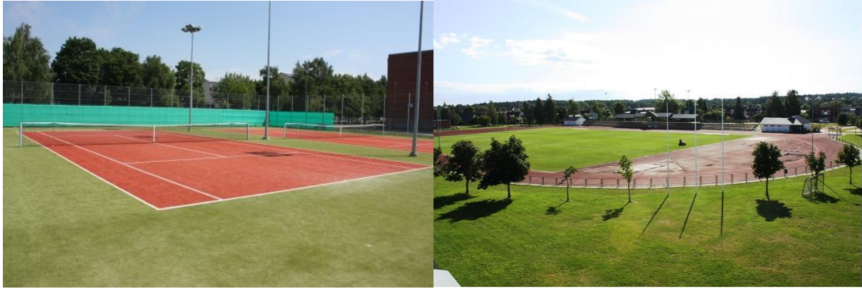
Tennis court and athletics stadium.

All fencers and coaches (except Estonian fencers and coaches) will stay after the Nordic Championships in Tallinn and they are accommodated in official hotel Radisson Blu Hotel Olympia. On 29.09.2014 there will be shuttle busses from the hotel to the Haapsalu Sports Centre. On 03.10.2014 there will be shuttle buses from Haapsalu Sports Centre to Tallinn according to the departure times.