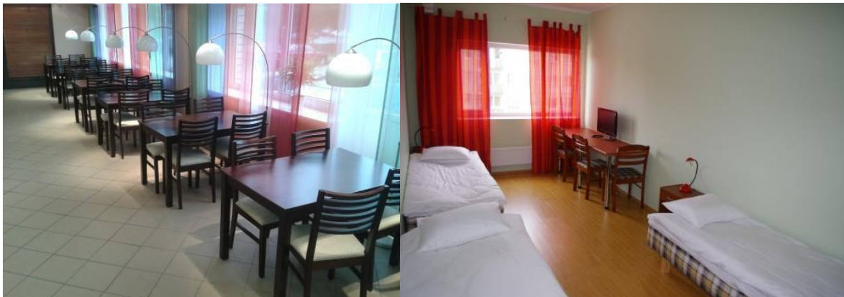
Restoran and hostel room.

All fencers and coaches (except Estonian fencers and coaches) will stay after the Nordic Championships in Tallinn and they are accommodated in official hotel Radisson Blu Hotel Olympia. On 29.09.2014 there will be shuttle busses from the hotel to the Haapsalu Sports Centre. On 03.10.2014 there will be shuttle buses from Haapsalu Sports Centre to Tallinn according to the departure times.